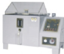
Salt spray test