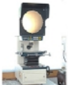
Three coordinate measuring