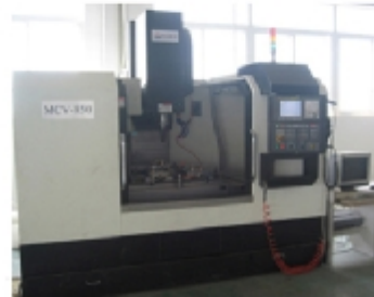
SPECIAL THREAD CMC MACHINE